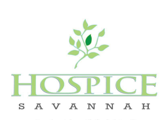
People with a gift for helping.™

The center leaf in our logo represents our patients. They are surrounded by family members and loved ones; compassionate Hospice Savannah staff and volunteers; and by the donors who make our care possible.