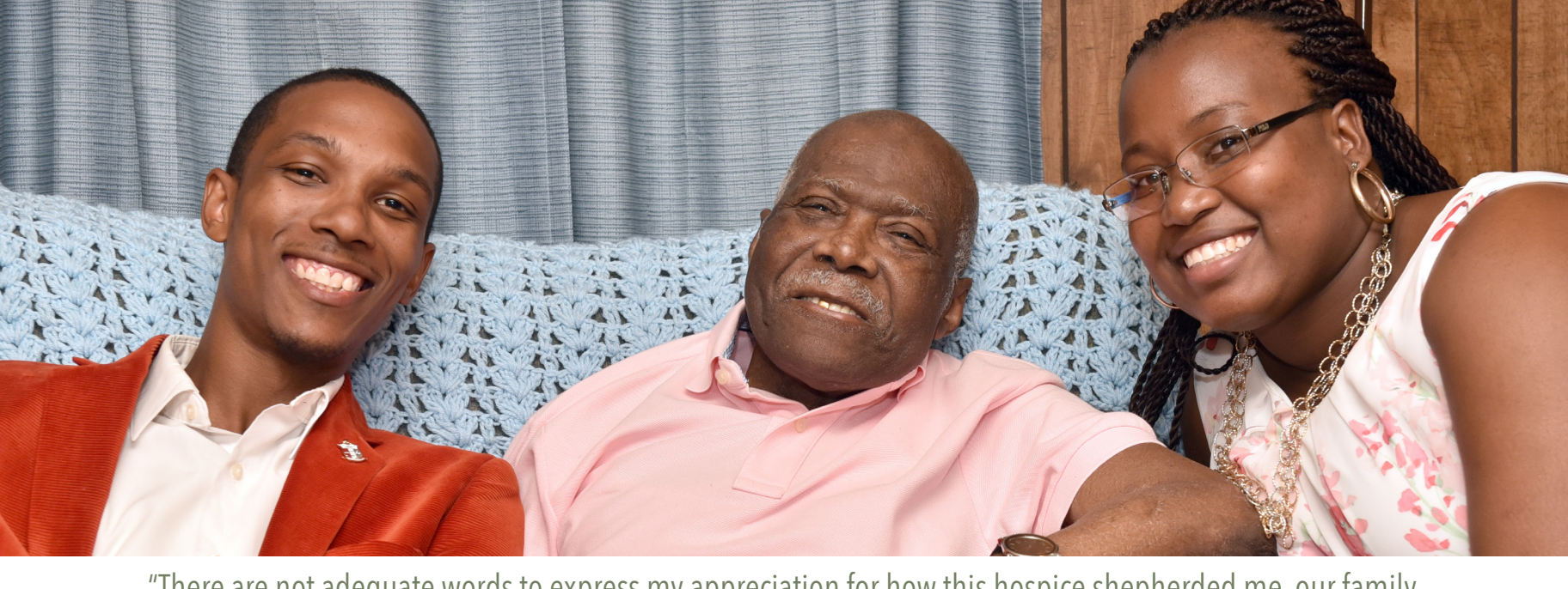
"There are not adequate words to express my appreciation for how this hospice shepherded me, our family, and our loved one through this final journey. I will be forever grateful for your compassionate care."