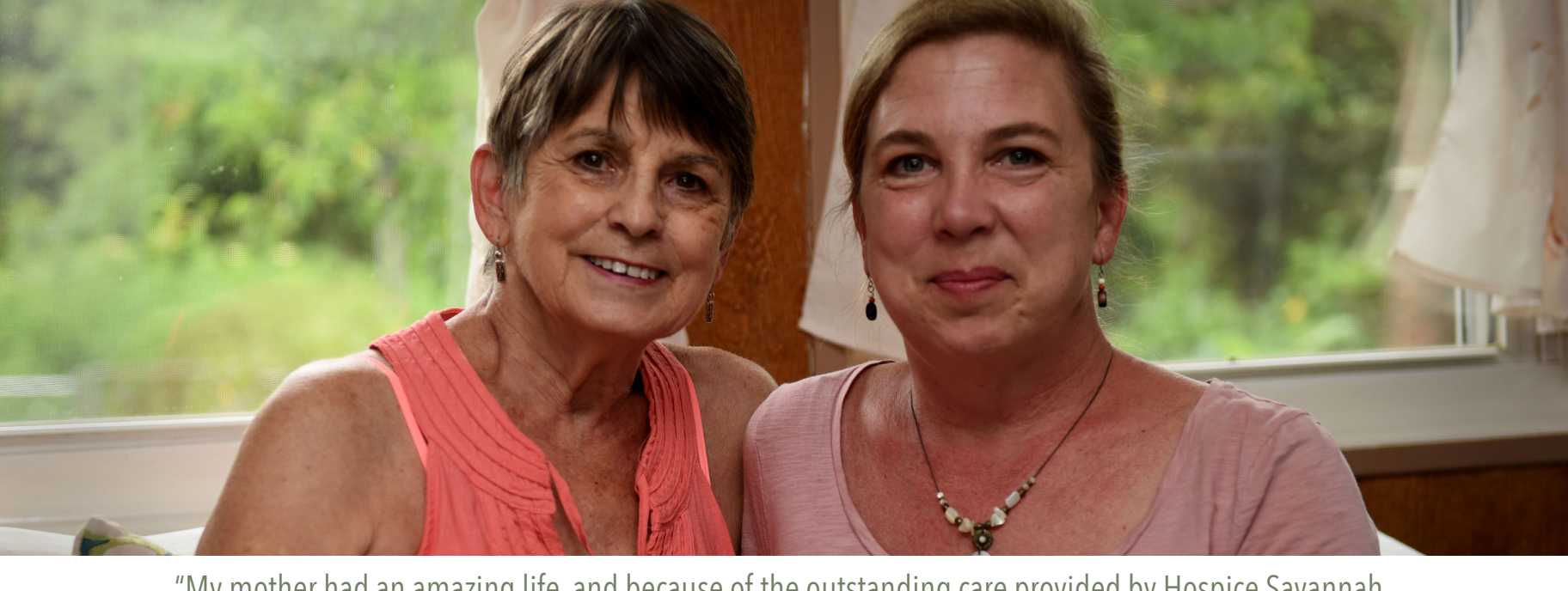
"My mother had an amazing life, and because of the outstanding care provided by Hospice Savannah, she had an amazing death. Bless all the caring and compassionate staff."